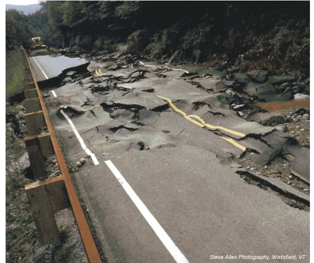
Road damage as a result of flash flooding.

When you approach a flooded road, TURN AROUND, DON'T DROWN!