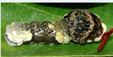
CATERPILLAR THAT LOOKS LIKE BIRD POOP