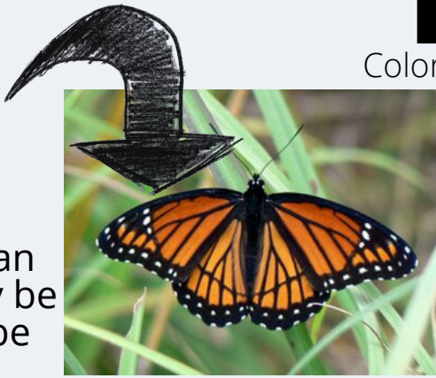
Viceroy Viceroy's aren't posinous but they mimic Monarchs who are!

Bright colors like orange can tell an animal that they may be poisonous and shouldn't be eaten