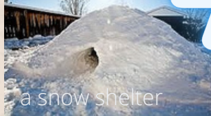
a snow shelter